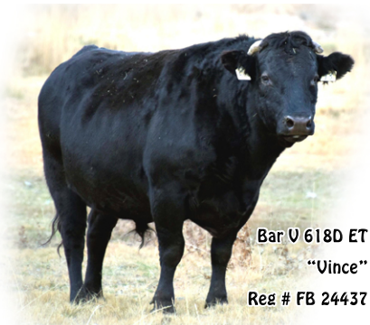
Bar V 618D ET "Vince" Reg # FB 24437